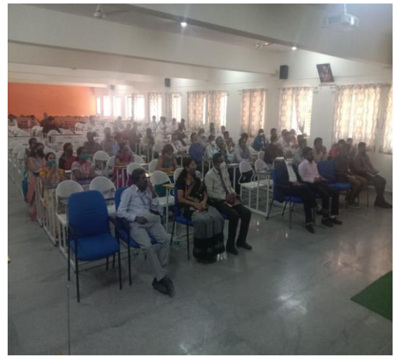
Fig 4: Audience on National Youth Day