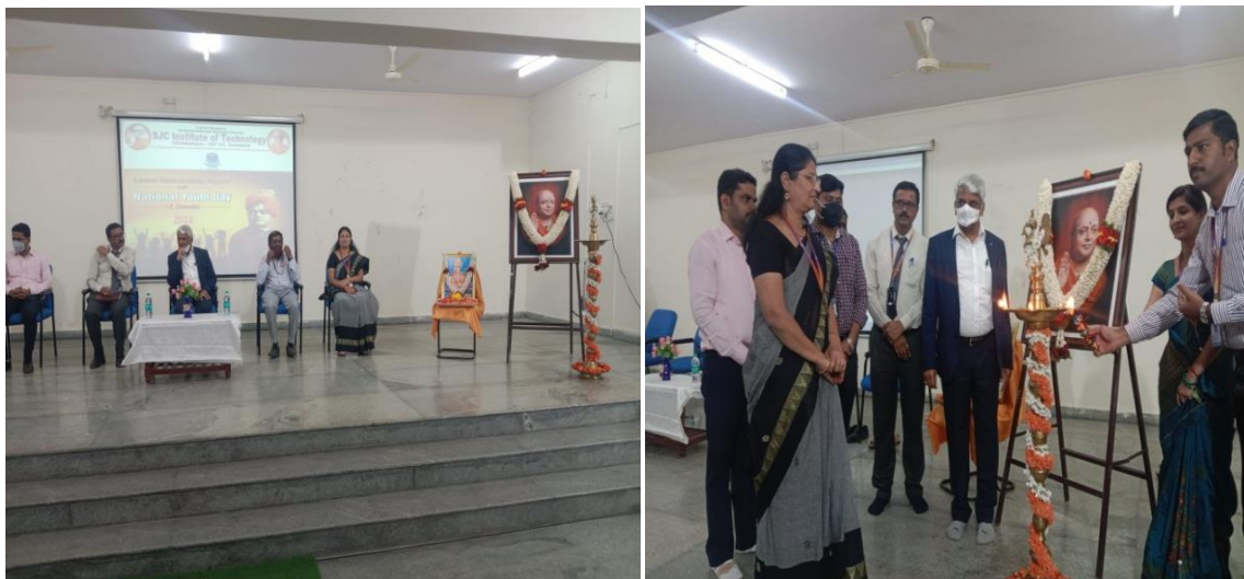
Fig 2: Inauguration of National Youth Day on 12.01.2022