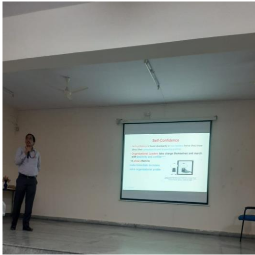
Fig 3: Talk by session speaker on 12.01.2022