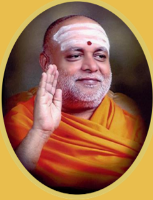
Sri Sri Sri Dr. Balagangadharanatha Mahaswamiji